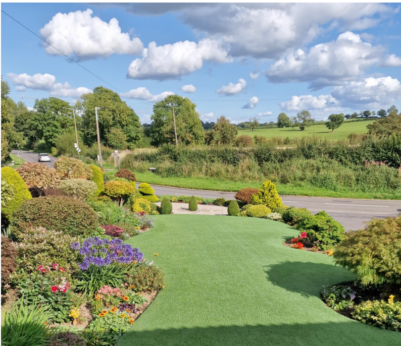
1st Prize for Best Landscaping

As always it is a tough decision with approximately 20 gardens being shortlisted for every category, and the competition was fierce with some amazing botanical displays throughout our village. Unfortunately black and white print does not do these gardens justice, they were all phenomenal and a testament to the hard work and dedication from Kilburn's talented, green fingered gardeners. All the winners were awarded their prizes at the Parish Council meeting on Monday 4th September.