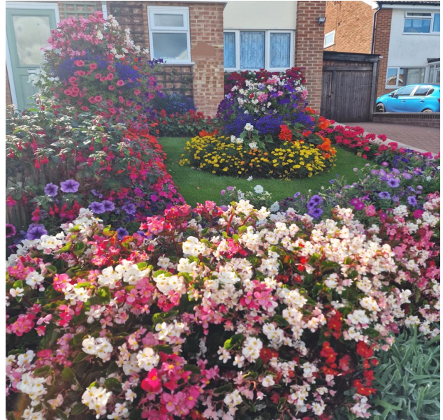
1st Prize for Best Floral Display

The village garden competition is one of the favourite events for the Kilburn Parish Council. Each year, throughout July we visit every street in Kilburn to create a short list of the best gardens in the village. On Monday 31st July the Mayor of Amber Valley used this list to award 1st, 2nd and 3rd place for each of the following categories: Best Landscaping, Best Floral Display, and Best Hanging Baskets.