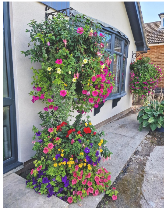
1st Prize for Best Hanging Baskets