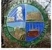
KILBURN PARISH COUNCIL

Our next meeting will be held on Monday 11th April at 7:30pm. The meeting will be preceded by the Annual Parish Meeting commencing at 7pm—please see the separate notice included in this newsletter.