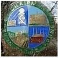
KILBURN PARISH COUNCIL

These past few months have been very 'interesting' times with everything being 'turned on its head' due to the pandemic. Members of the Council trust that residents of Kilburn have kept safe and are coping with the current situation.