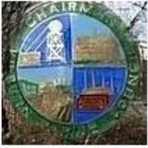
KILBURN PARISH COUNCIL

The Parish Council continues to hold its meetings via zoom on the 2nd Monday of each month. Once again – should any parishioner wish to attend please contact the Clerk for an invitation.